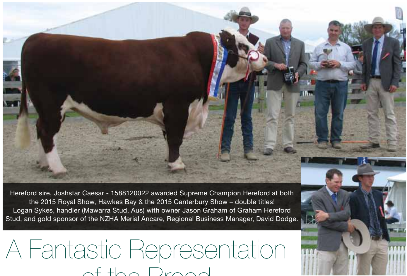
of the Breed

THE BI-MONTHLY NEWSLETTER OF THE NEW ZEALAND HEREFORD ASSOCIATION