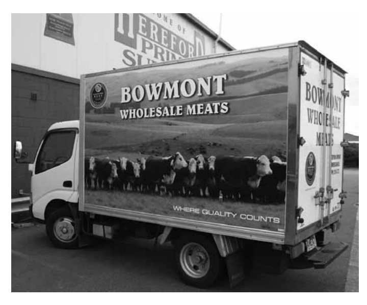
Each side of the delivery truck is different – creating a very striking and impressive sight on the roads of Southland.