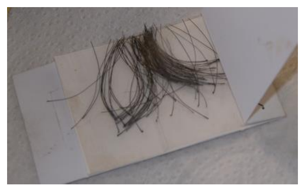
Figure 2. Collecting a DNA Sample for DNA parent verification, pull 20-30 thick hairs from the brush of the animal's tail including the hair roots.

The genotyping laboratories offering this service in Australia (e.g. Zoetis Genetics and AGL) generally use tail hair samples (hair roots attached) as a source of DNA, however they can use other samples such as blood, semen or tissue if required. Most breed societies have regulations for DNA