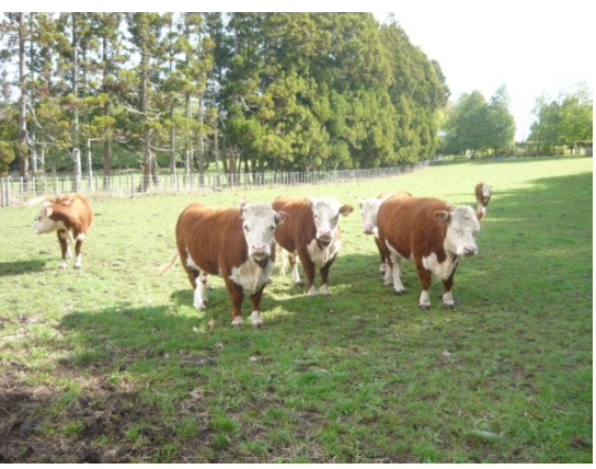
Placid cows in their new Kiri Point home - Drury