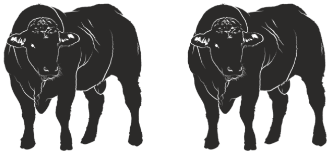
Bull 1 Index = $60